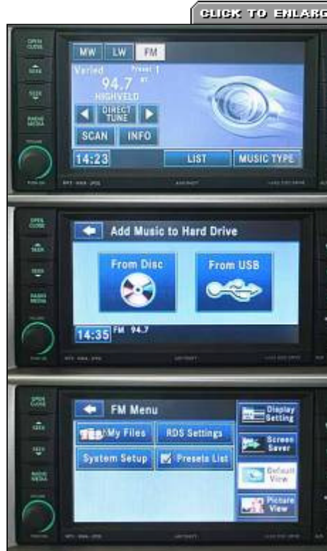
CHOICE IS YOURS: Chrysler's new MyGIG infotainment system offers a number of touch screen facilities that can be run with voice commands.