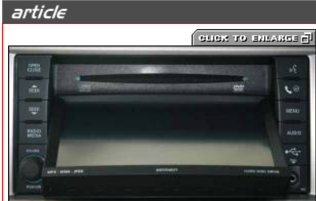
HIGH-TECH FIRST: Chrysler SA has introduced MyGIG, a multimedia infotainment system that can include satnav and a reversing camera, across three of its brands.